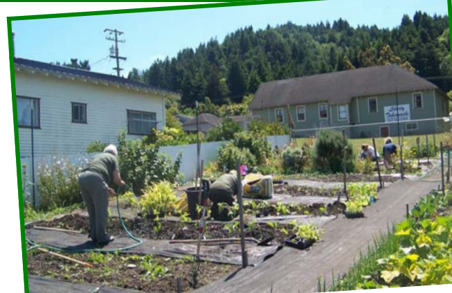
A generous donation of vegetable starts from Pierson Building Center gave reason to play in the garden as well