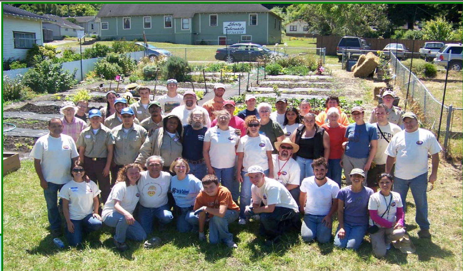
Over 50 volunteers helped to plant 19 fruit trees, 12 berry bushes, vegetable starts and install an irrigation system and deer fencing