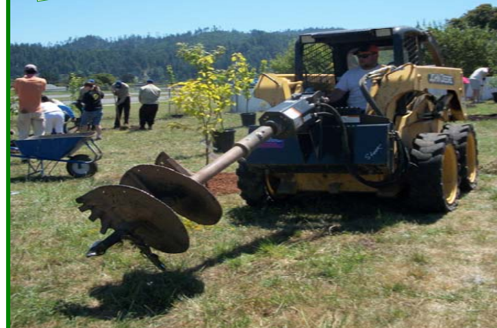
Allen Terry provided and operated the 20'' auger that prepared the holes for our trees to be planted in