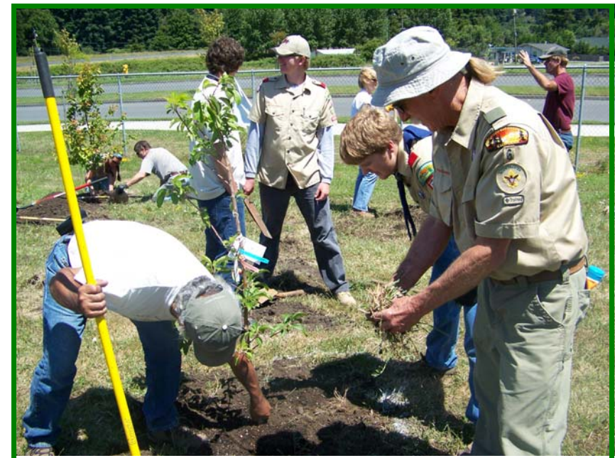
Boy Scout Troop 6, Sponsored by the Scotia Volunteer Fire Department