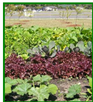
19 fruit trees now located below the community garden